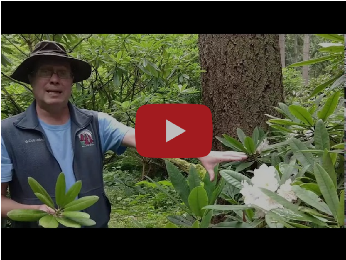
The Glanduliferum Complex Part 1 (5:21 min)

Rhododendron auriculatum