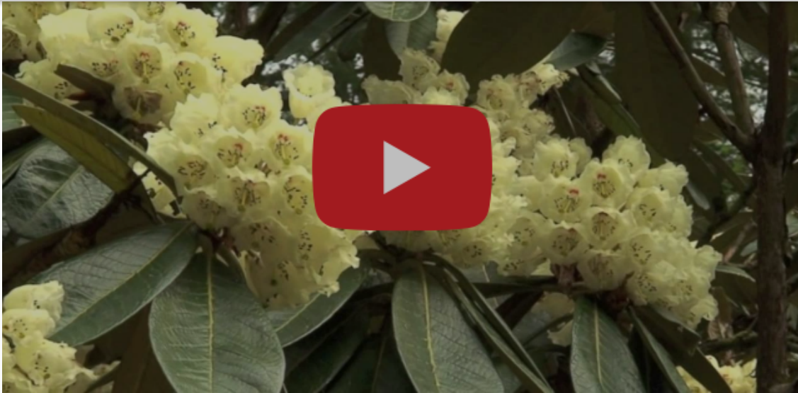
A tour of Benmore Botanic Garden (6 min)