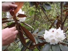
R. rex ssp. fictolacteum