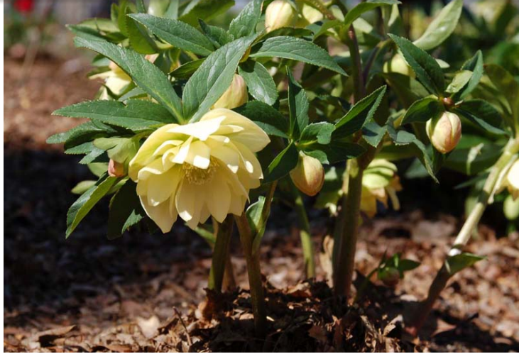
Hollies, Hellebores, and Hamamelis