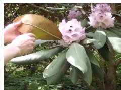
R. rex ssp. rex